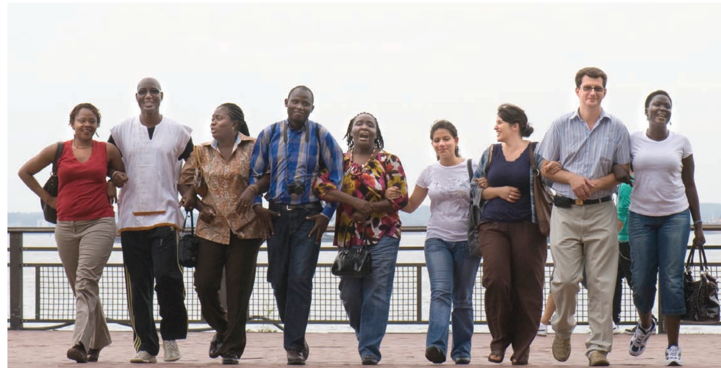
Photo below and on the cover—The Advocates visited the Statue of Liberty at the end of orientation week.