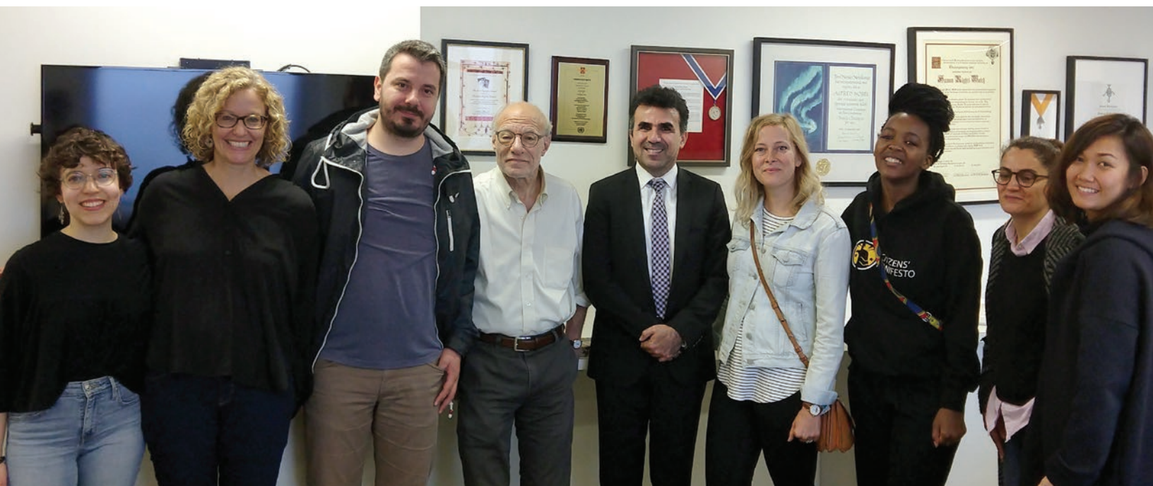
AHDA Fellows meeting at Human Rights Watch

The workshop provided training and professional development to human rights and social justice professionals and students. The workshops addressed both practical skills and thematic issues intended to enhance the work of those engaged in human rights, historical dialogue and social justice work. These include Research and Documentation, Human Rights Campaigns and Advocacy, Organizational Leadership for Human Rights, Teaching Human Rights, and Business and Human Rights.