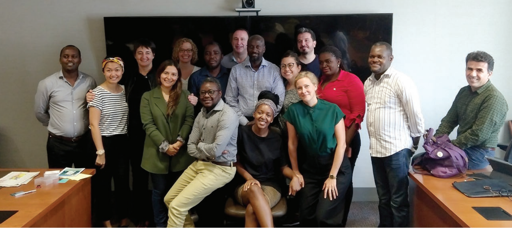
AHDA Fellows in a meeting with HRAP Advocates