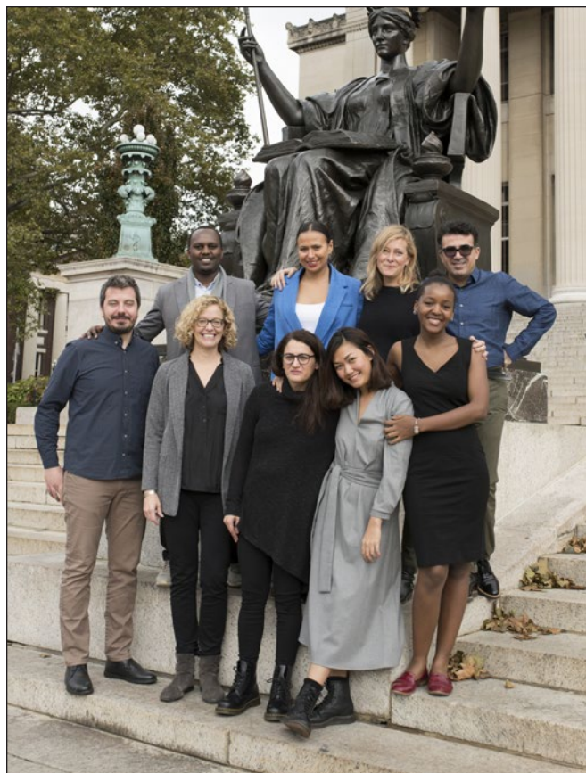
Fellows on the steps of Low Library, Columbia University

Finally, AHDA's signature fellowship continues to welcome to Columbia University an international group of practitioners and scholars working in fragile environments and with vulnerable populations. The fellows benefit from the curriculum, capacity building, project development and networking opportunities at the Columbia University to foster their field related projects. The fellows serve as an inspiration at the University and back home - their projects and collab-