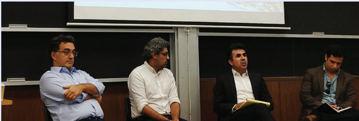
AHDA Fellow presenting during the panel with USHMM

As an AHDA fellow, I pursued a project " The Voice of the 74th Genocide: A Platform for Yazidi Youths. " The focus of the project is memory work of Yazidis, the trauma they faced in August 2014 and reconciliation of their relations with their Muslim neighbors, both Kurds and Arabs. Another issue that project will address is how to initiate a 'trust building' process through historical dialogue between Kurds and Arabs (the specific situation of Yazidis Distrust in Arabs and difficulties in re-communicating with the Kurds). The ultimate goal of the project is to provide a suitable platform for Yazidi youth in order to give voice to their own stories, to deepen the discussion and to reveal the root causes of the mistrust as well as to foster their motivation of searching solutions.