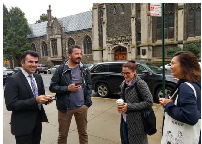
AHDA Fellows had extensive networking meetings

A special thanks to the members of Columbia University community who helped to welcome fellows, agreed to meet with them and served as advisors, mentors, and experts in a wide range of fields. These individuals are acknowledged by name in Networking@Columbia segment.