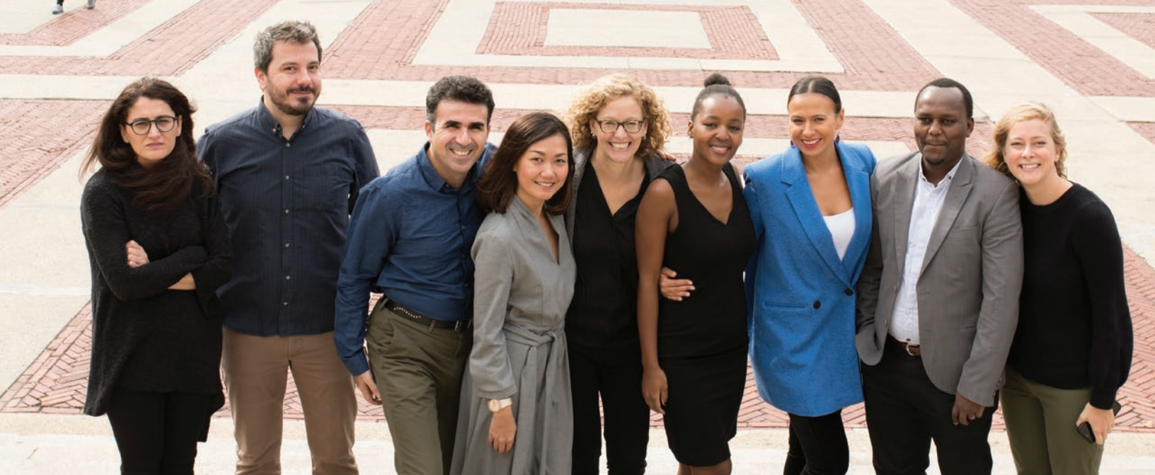
AHDA fellows engaged with networks at the University, NYC and Washington DC