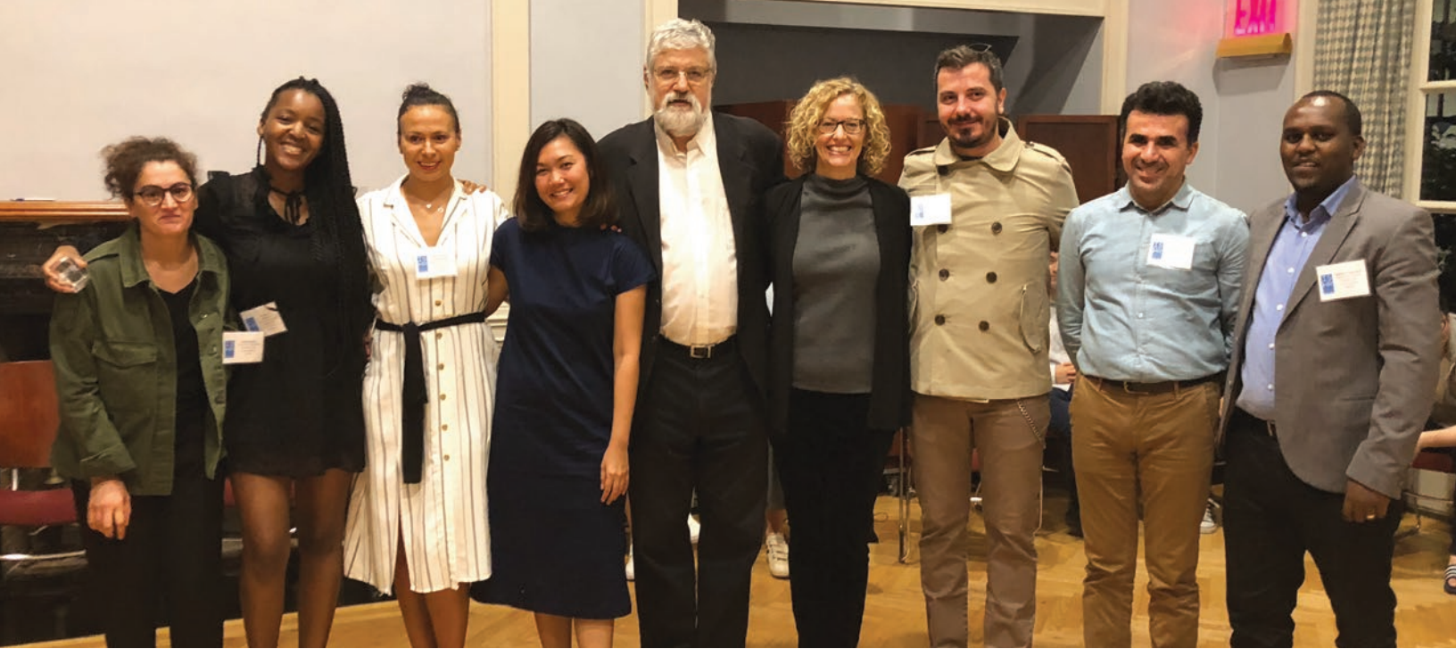
AHDA Fellows introduced themselves to University community