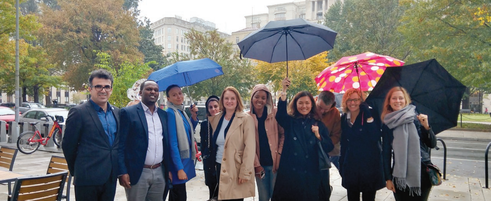
AHDA Fellows' Trip to Washington D.C. November 2018