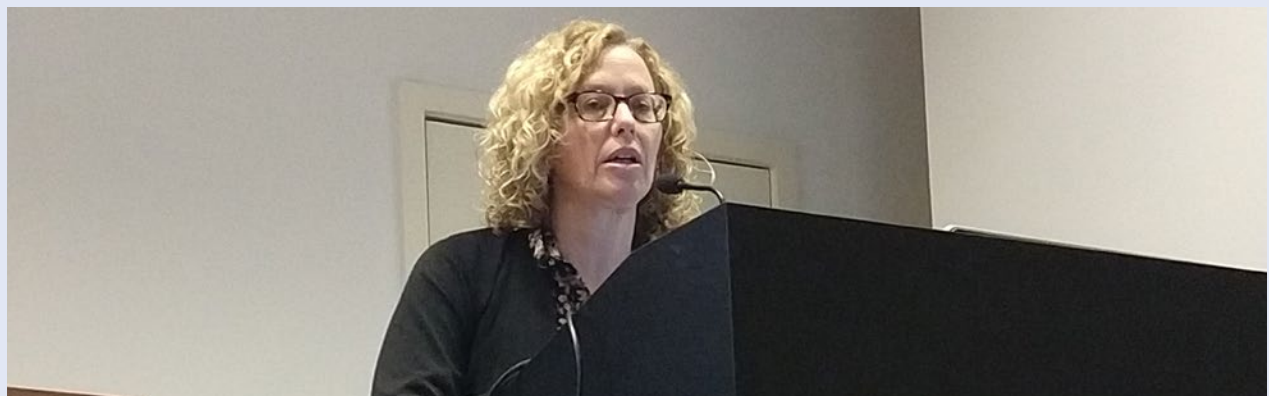
AHDA Fellow presenting at the Introduction to Human Rights class