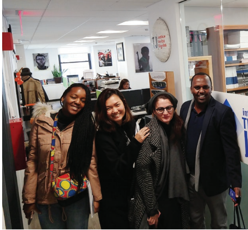
AHDA Fellows visiting ICTJ in New York