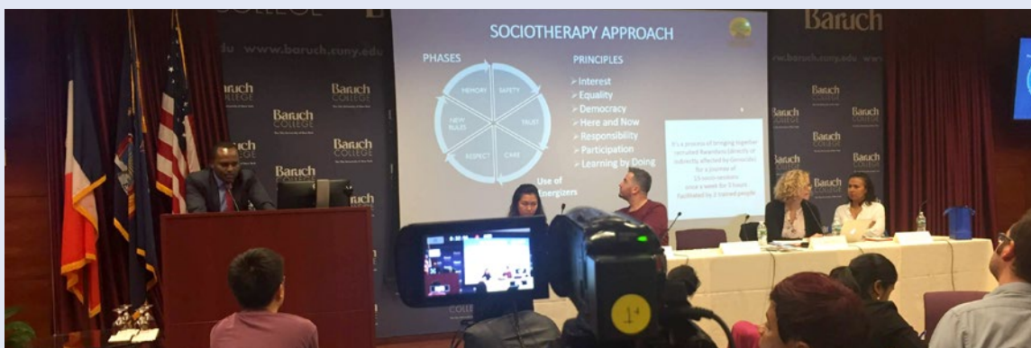
AHDA Fellows Presentation at Baruch College