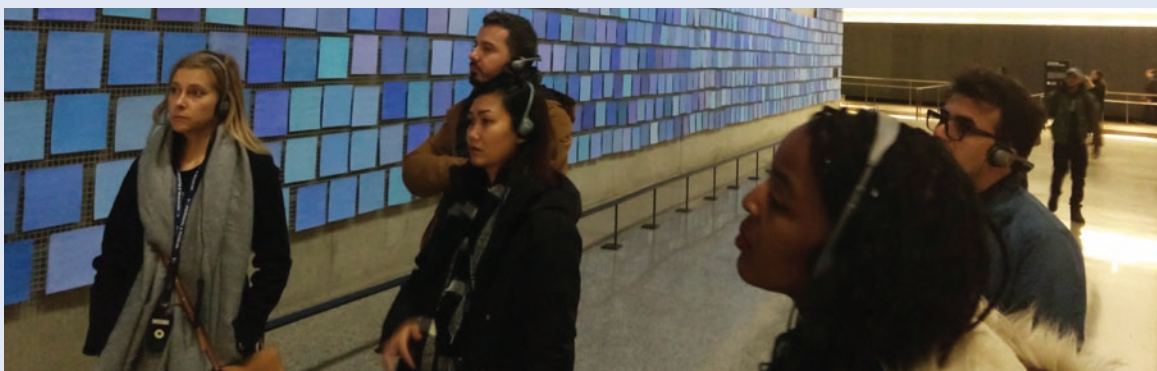
AHDA Fellows visiting September 11 Memorial Museum