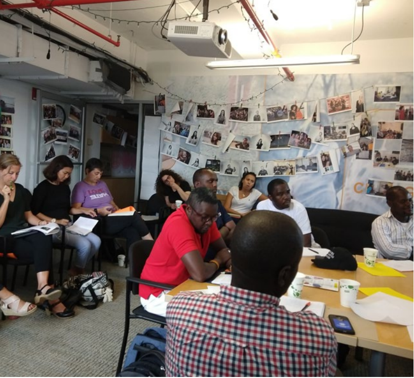
AHDA Fellows participated in the workshop at WITNESS