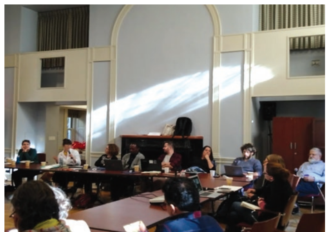
AHDA co-sponsored workshops with fellows and international scholars