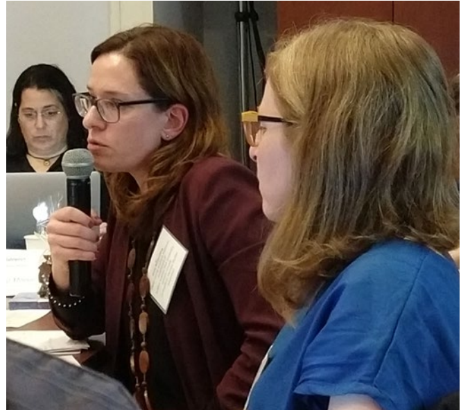
AHDA co-sponsoring Memory Activism Workshop