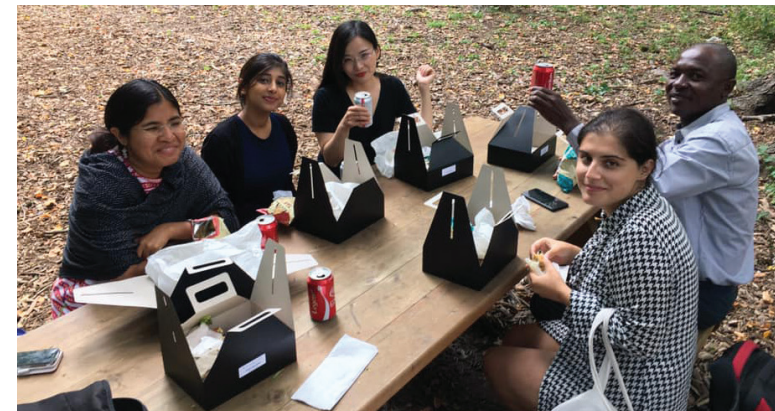
If it's a boxed lunch, it must be HRAP!

Having the opportunity to speak to the advocates candidly around LGBTI rights in their countries was incredibly inspiring. The HRAP advocates' thoughtful questions helped me think through my organization's role and critically think of the next steps for the LGBTI movement. I hope they learned from me as much as I learned from them.